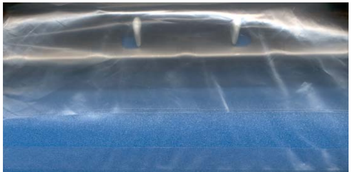
Protective rubber bumpers and heavy duty plastic bags insure package integrity until ready for use.